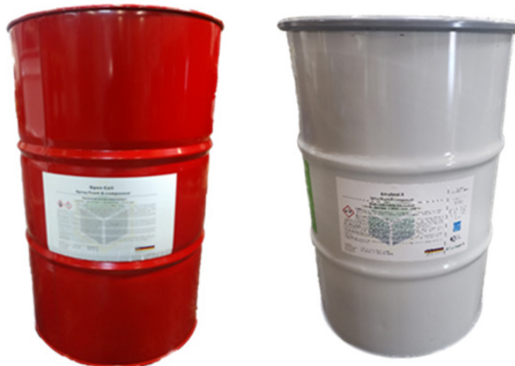
Figure 1. Enverge EasySeal .5 Spray Foam Insulation Isocyanate (A-Side) and Resin (B-Side)

2.1 The innovative product evaluated in this report is shown in Figure 1 and Figure 2 .