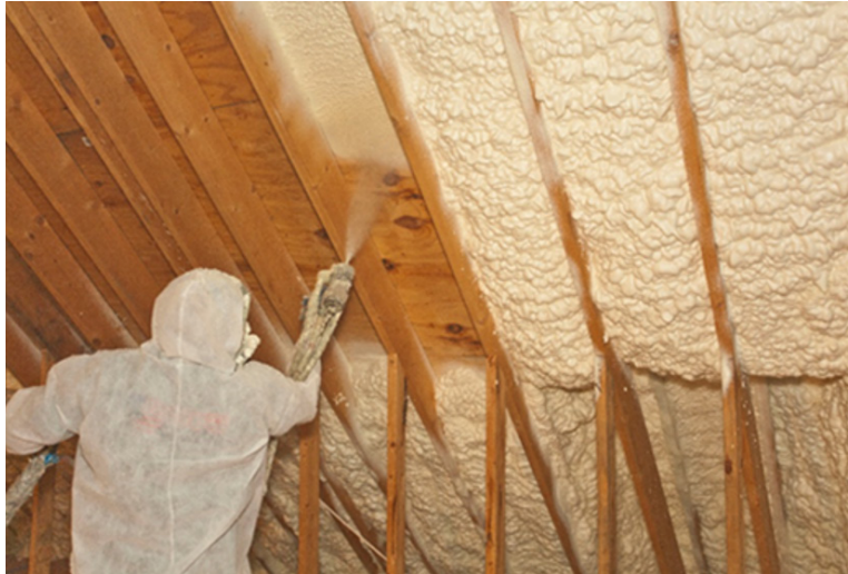
Figure 2. Application of Enverge EasySeal .5 Spray Foam Insulation in an Unvented Attic